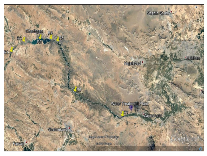
Figure 1: Sampling location

This index is applied using the concentration measured with the parameters of nitrate, phosphate, COD, and the DO at the permissible limit according to Iran's water quality standard for classification of the organic charge or contamination due to organic compounds in water.<sup>[8]</sup> Indices used in assessing risk and pollution of water on lake are shown in Table 3.